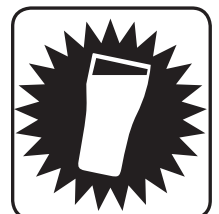
EXCLUSIVE BREWERY COLLABORATIONS