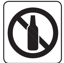
NO BOTTLED BEER