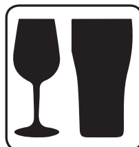
BAR TYPE BEER & WINE