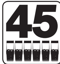
CLASSIC ARCADE GAMES

6 ST. MARK'S PLACE NYC 10003 infostmarks@barcade.com